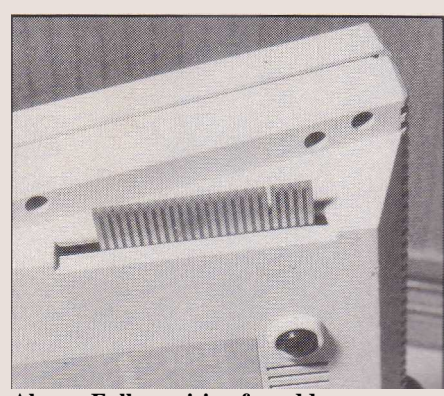
Above: Full provision for add-ons. Below: Several LCD screens can be

modes 0 to 6 only, since there is no 5050 teletext chip. A monochrome version of the BBC's mode 7 is, however, emulated in the mode 0 display. To provide full-colour teletext the computer may be fitted with a software-controllable Super Teletext daughter board. complete with UHF input and tuner. which plugs into a connector on the motherboard. Screen memory occupies half of one 64K bank of the 65816 address space. The LCD interface supports a 256by 64-pixel screen, which may be a window of the main display or totally separate. BBC SOFTWARE