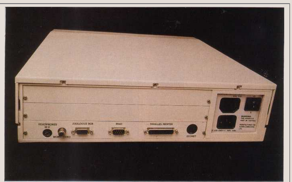
The back of the Archimedes is relatively sparse by today's standards, consisting of: headphone sockets, mono video out, analogue RGB, serial, parallel and Econet. The two removable plates above the ports will accommodate 'podules' —that is, peripheral modules

The 64 base colours can be chosen from the total of 4096 only in groups of 16 at a time. Nevertheless, the colour range available in mode 15 is