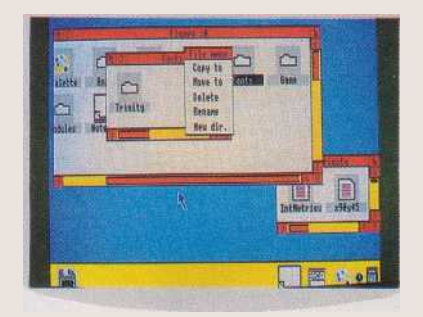
The Acorn WIMP interface is fast, colourful and easy to use. The Archimedes makes this all possible from a BBC Basic program

Arithmetic operations can be performed between two arrays of the same dimensions, and matrix multiplication is supported between vectors and 2D matrices.