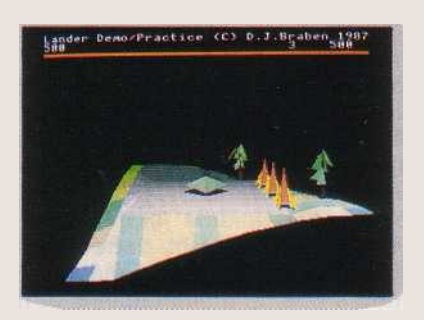
The Archimedes bundled 'lander' game, written in BBC Basic, is destined to become as famous as the Amiga's 'bouncing ball' demo

returns the current mouse position in X and Y and the button status, and you call it as often as needed. The command MOUSE RECTANGLE defines the screen area in which the mouse pointer can be moved. I was able to write a quite nifty mouse driven painting program in a couple of hours and 77 lines of Basic.