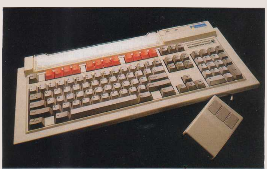
One concession to 'industry standards' is the Archimedes keyboard, which offers both IBM PC and BBC Model B compatibility. Like the Model 300 it has red function keys, presumably to persuade BBC Model B owners to 'upgrade' to an Archimedes. A threebutton mouse is fitted as standard

Enough has been written about the Acorn ARM chip (in this magazine, by myself, for one) that I shall only briefly describe this new processor. It is a full 32bit processor of classic RISC (Reduced Instruction Set) design. It uses 27 32bit registers and a small instruction set of 44 simple instructions, almost all of which ex