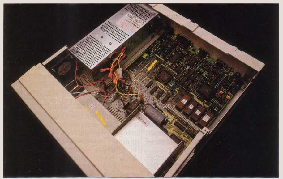
Critics of the Model B's PCB will be pleasantly surprised by the minimal chip count of the Archimedes. The absence of 'glue' chips means that it has fewer chips than all the popular 16bit and 32bit micros

good enough to create almost photographic realism. Modes 18 to 20 gives 512 lines of vertical resolution and need a Multisync monitor to display them. The teletext mode 7 of the BBC Micro is retained for compatibility. There are also text modes ranging from 40 characters x 25 lines to 132x32 in up to 16 colours.