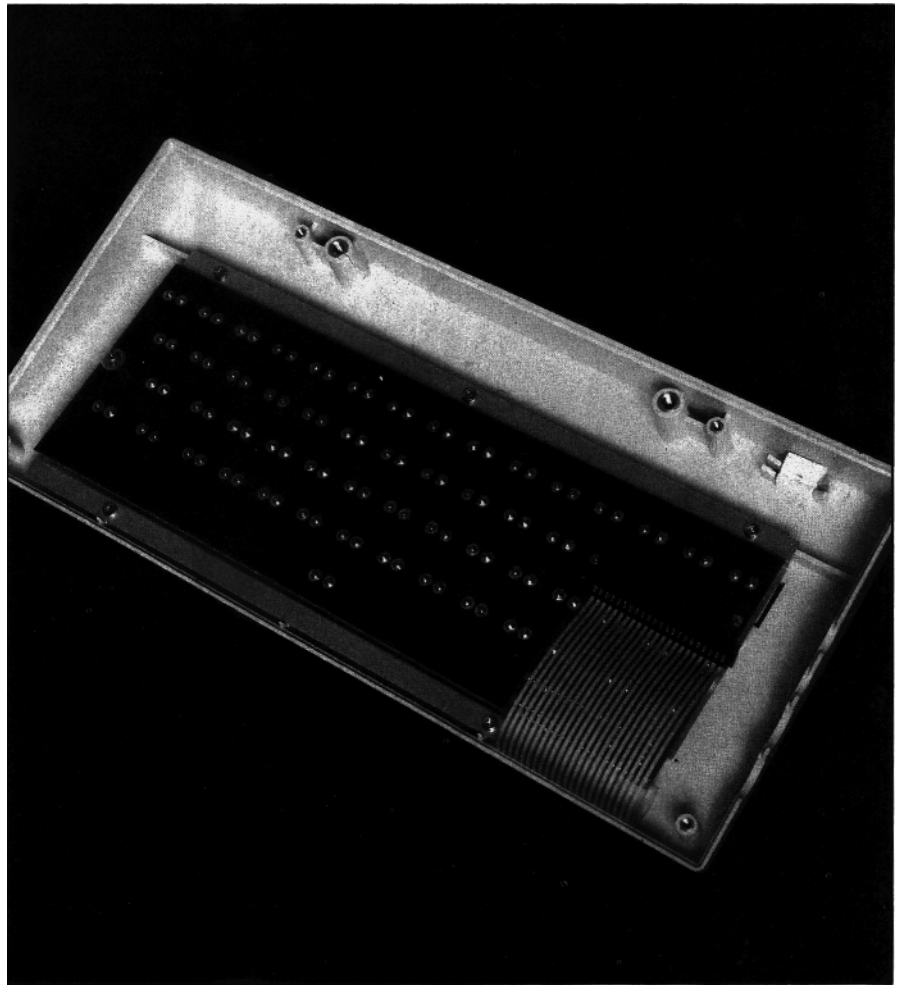
Not a patch in sight

The User Manual follows the pattern set by the final version of the BBC Manual and is particularly strong on machine code, giving a thorough introduction to 6502 assembly language. This is one of the Electron's strong points — it features a