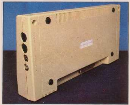
Sockets for TV, monitors and cassette